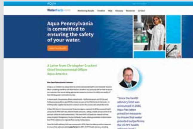
A 2018 WRF webcast shared Aqua PA's response to PFAS, including the launch of their WaterFacts website

In the wake of these findings, Aqua PA responded swiftly by taking selected wells offline and retrofitting them with GAC treatment. Aqua PA also began piloting anion exchange at one of the affected wells. Aqua PA hosted a series of public meetings and briefings for local elected officials. In addition, Aqua prioritized customer outreach and education, primarily by creating a website called waterfacts.com , which communicates information on PFAS and shares results of ongoing PFAS monitoring. The site includes a glossary, FAQs, and links to other helpful resources from EPA.