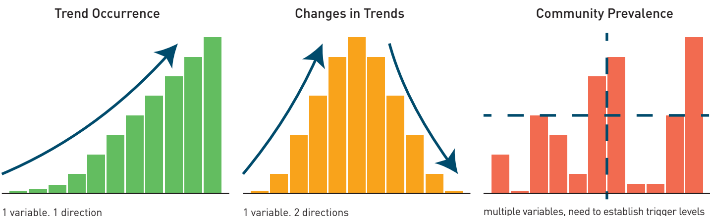
Figure 1. Increasing complexity for wastewater surveillance applications

be able to calculate community prevalence from the viral RNA gene copy number. In many cases, an assessment of community infection may also require a more comprehensive understanding of sewershed characteristics to estimate dilution in the sewer collection system and more accurately relate signal strength back to the population in the community. Still, Summit participants agreed that wastewater surveillance could offer valuable information to public health decision makers on the potential prevalence of community disease. This includes the identification of "hot spots" within a community, provided that an appropriate spatial sampling approach is implemented, as well as identifying areas that are not currently impacted by the virus. Summit participants also identified that intensive spatial sampling of wastewater could be used to provide information on the potential occurrence of COVID-19 in specific confined sub-communities such as correctional facilities, aged care facilities, or schools.